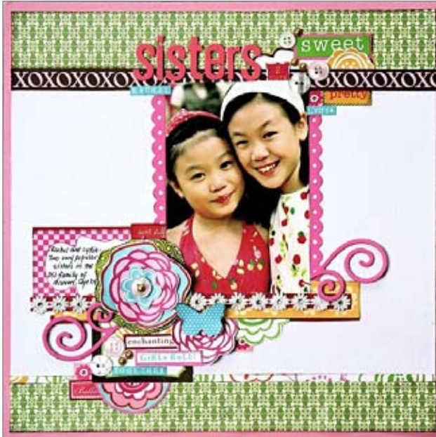
Bella Materials Used: Trellis (Plastino), High Maintenance, Party Girl, Bits A Bella (Flirty)