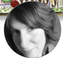
"Short and Sassy"