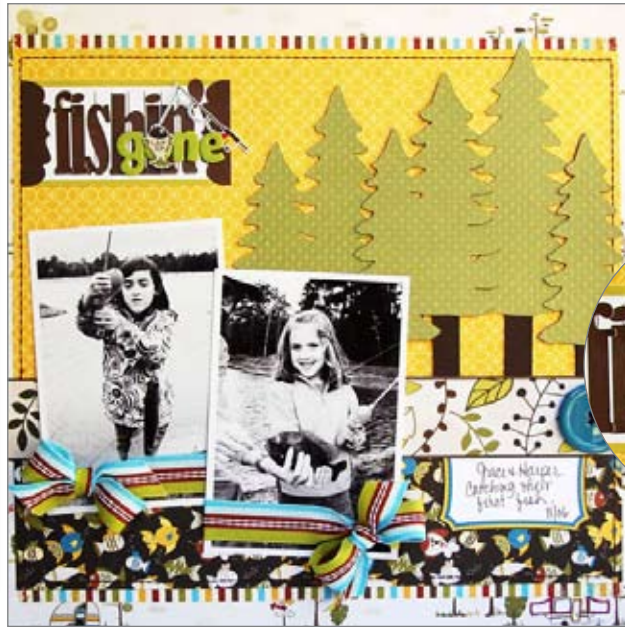
Bella Materials Used: Trellis (Plastino), High Maintenance, Party Girl, Bits A Bella (Flirty)